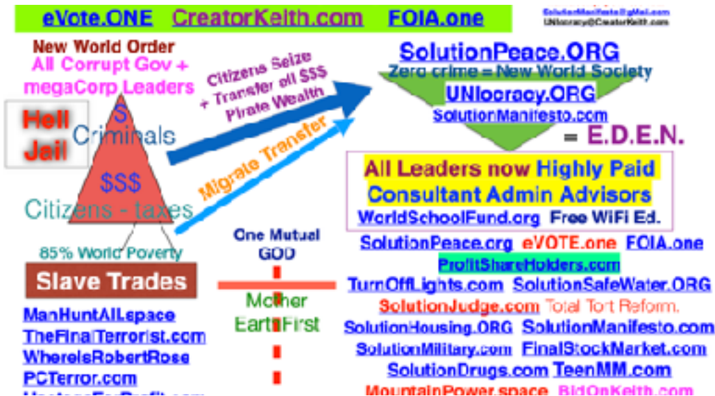
UNlocracy.org Diagram of New World Sovereign No crime Universal Society

(C)(r)(TM) Patents held by FortuneOne.org CreatorKeith.com