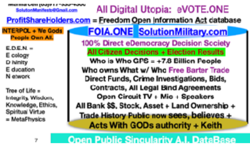
FOIA.ONE Universal Stabilizing OPEN Public shared World Database