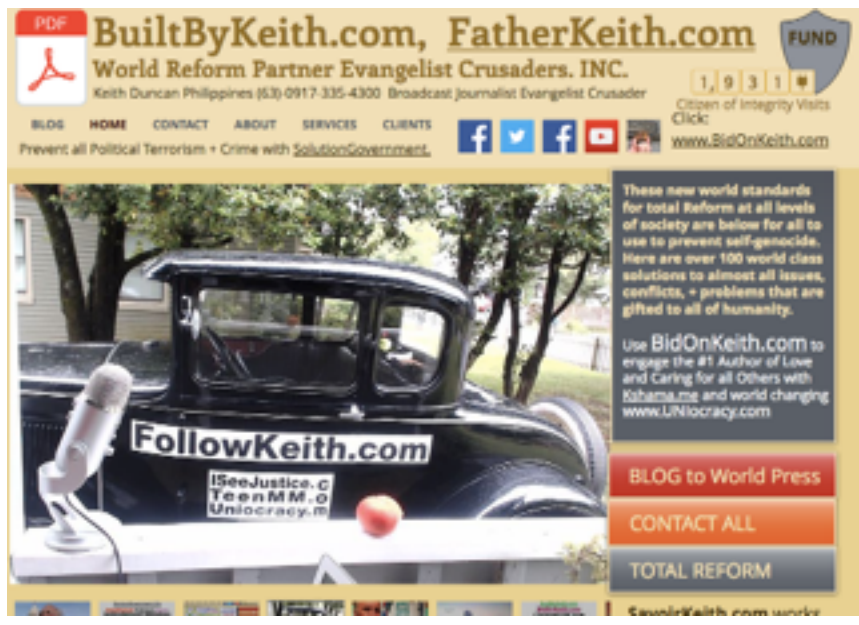
page 3of 8

black and white Last Testament Testimony scripture known as the Book of Life tied to INTERPOL URLiDent.com with Jurgen Stock. Who takes STOCK of humanity's evil condition and how to REMOVE all criminals with just a few simple methodologies created and deployed worldwide by FatherKeith.com (FollowKeith.com BidOnkeith.com BuiltByKeith.com CreatorKeith.com SaviorKeith.com